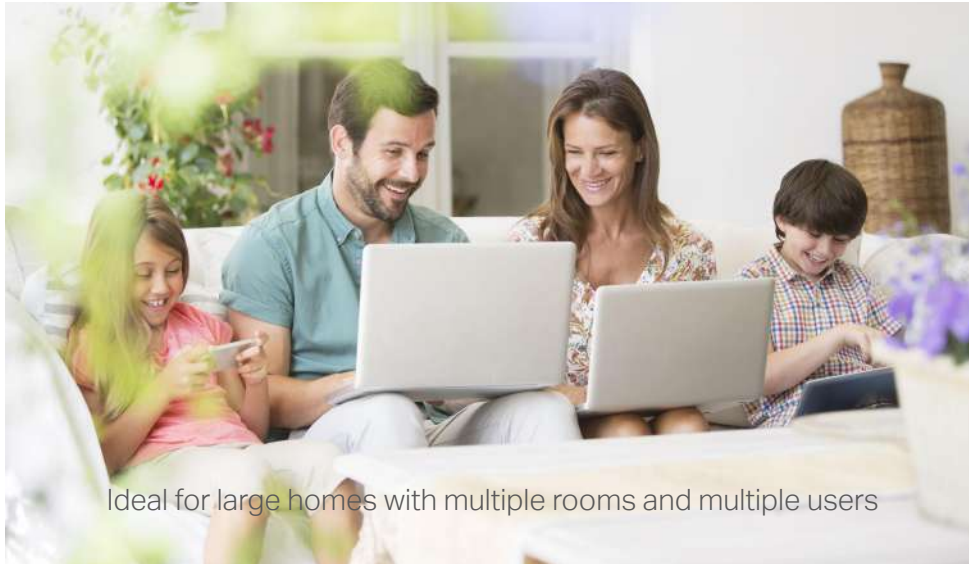
Ideal for large homes with multiple rooms and multiple users