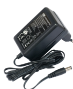
24V 0.8A Power adapter

The mANTBox15s is compatible with the SXT type mount, so you can use it with our durable and adjustable QuickMount systems. It comes with quickMOUNT PRO included. The mANTBox19s comes with metallic U bolt type mounts.