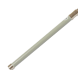
Dual Band 2.4/5Ghz (6dBi 2.4Ghz, 8dBi 5GHz)