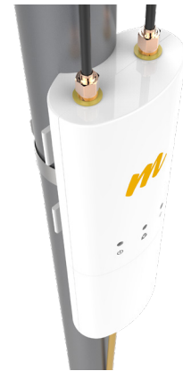
C5c on Pole