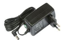
24 V 1.2 A power adapter included

IPsec hardware encryption (~470 Mbps) and The Dude server package are both supported, and the microSD slot provides improved read/write speed for file storage.