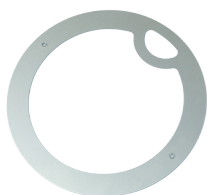
Ceiling mount base