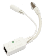
Gigabit PoE injector